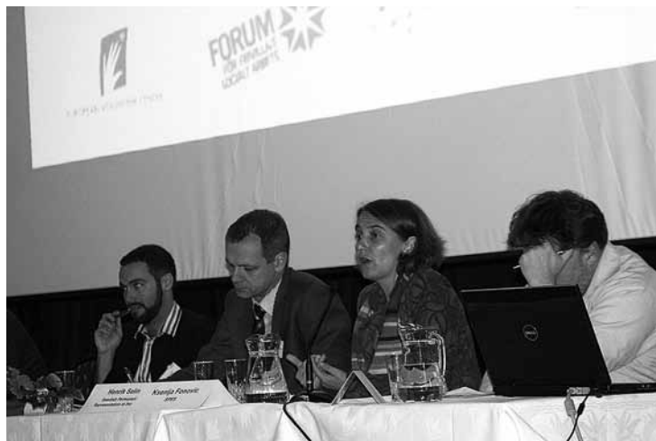
Members of the conference having a discussion

✉ Coordinamento Regionale dei Centri di servizio per il Volontariato della Lombardia Piazza Castello, 3 20121 Milano Italy @ http://www.csvlombardia.it/