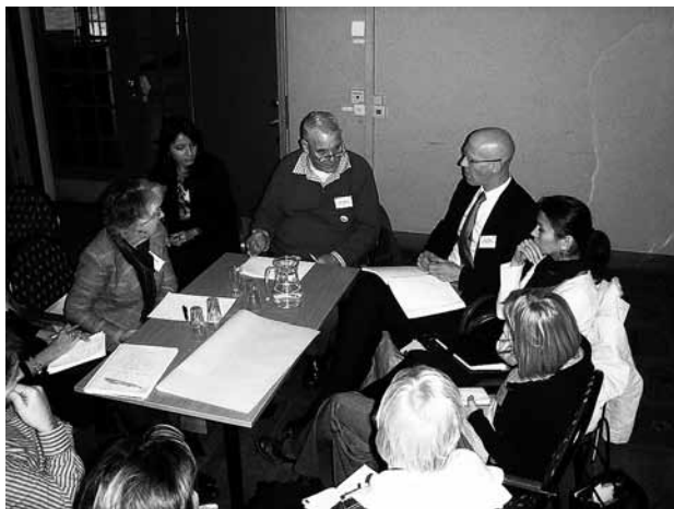
Members of the conference having a discussion

Funding and the support of the public sector are also important elements of the volunteering infrastructure; thanks to the regional funds which have been set up through the law, there is a permanent flow of financial resources towards volunteer centres and the support of the public sector has allowed these funds to be created and enables the voluntary sector to be strong and autonomous.